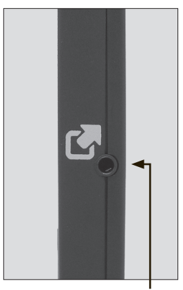
External device to activate the speech (Not included)